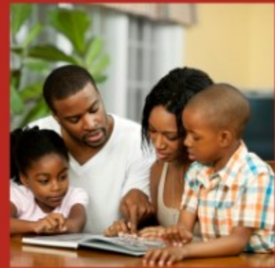
Storytelling Program Grades 4-6

The Sankofa Mentoring Program provides Black students in grades 4 to 12 with a powerful African-centered curriculum founded on the Ngozi Saba principles. Students can participate in various activities such as cultural games, drumming, creating storybooks for children, field trips, listening to guest speakers, learning about Black Heroes and Sheroes, as well as studying African languages. This program allows students to explore their racial and cultural identity, enhance their self-esteem, develop critical thinking skills, engage in self-reflection, foster teamwork, and promote the building of a stronger community. The program is available both online and in-person and includes tutoring/homework help for students registered in the program. Additionally, we offer programs for parents to encourage their engagement. Embark on a life-changing adventure by becoming a part of our community.