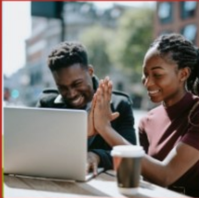
Sankofa Mentoring Program Grades 7-12