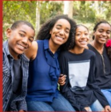
Sankofa Identity Program Grades 6-8